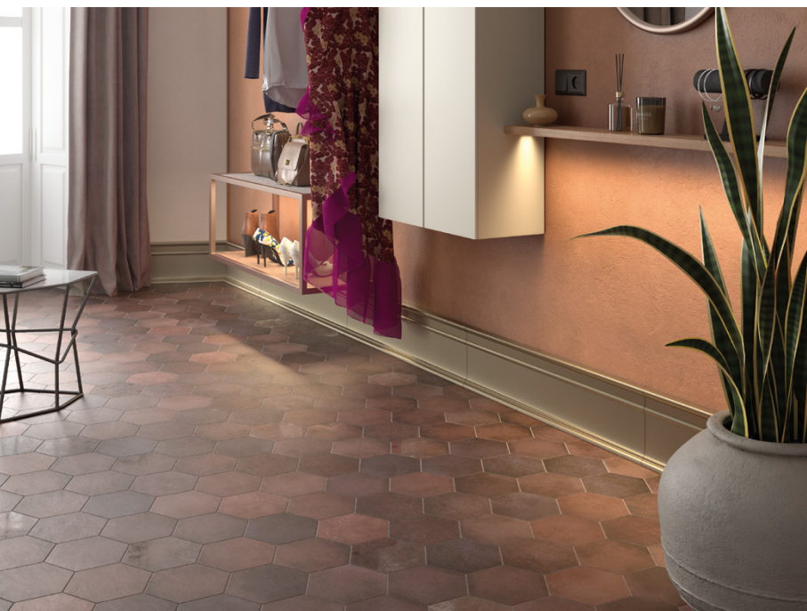
Heritage Wine 17,5 x 20 cm / 7" x 8"