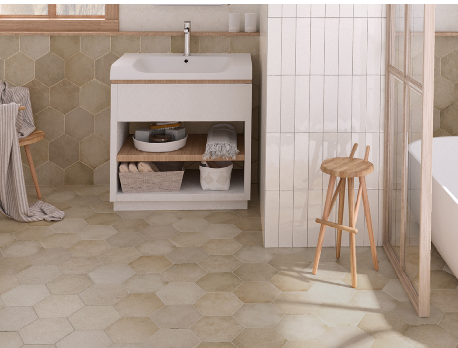
Heritage Wheat 17,5 x 20 cm / 7" x 8" Masla Blanco 7,5 x 30 cm / 3" x 12"