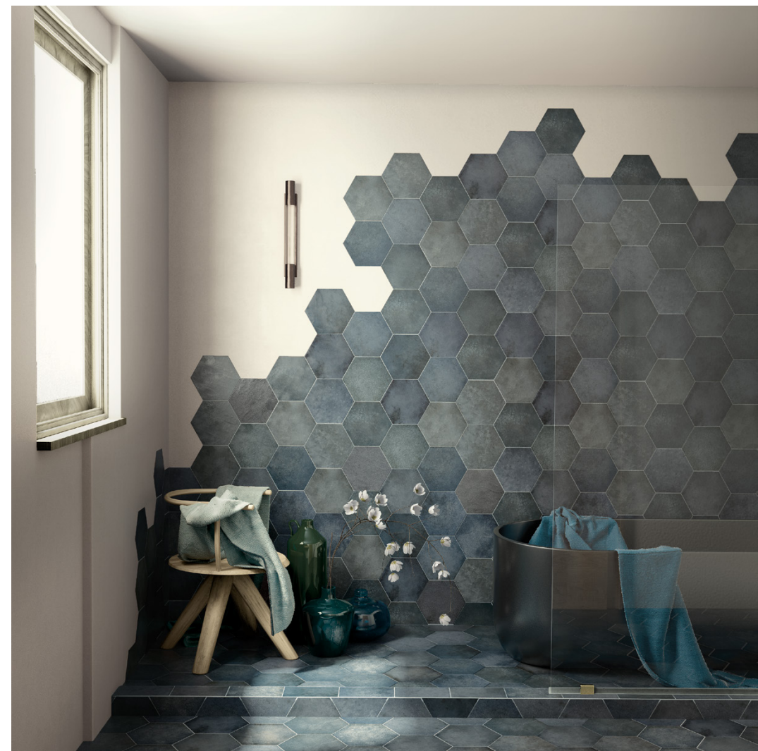
Heritage Indigo 17,5 x 20 cm / 7" x 8"