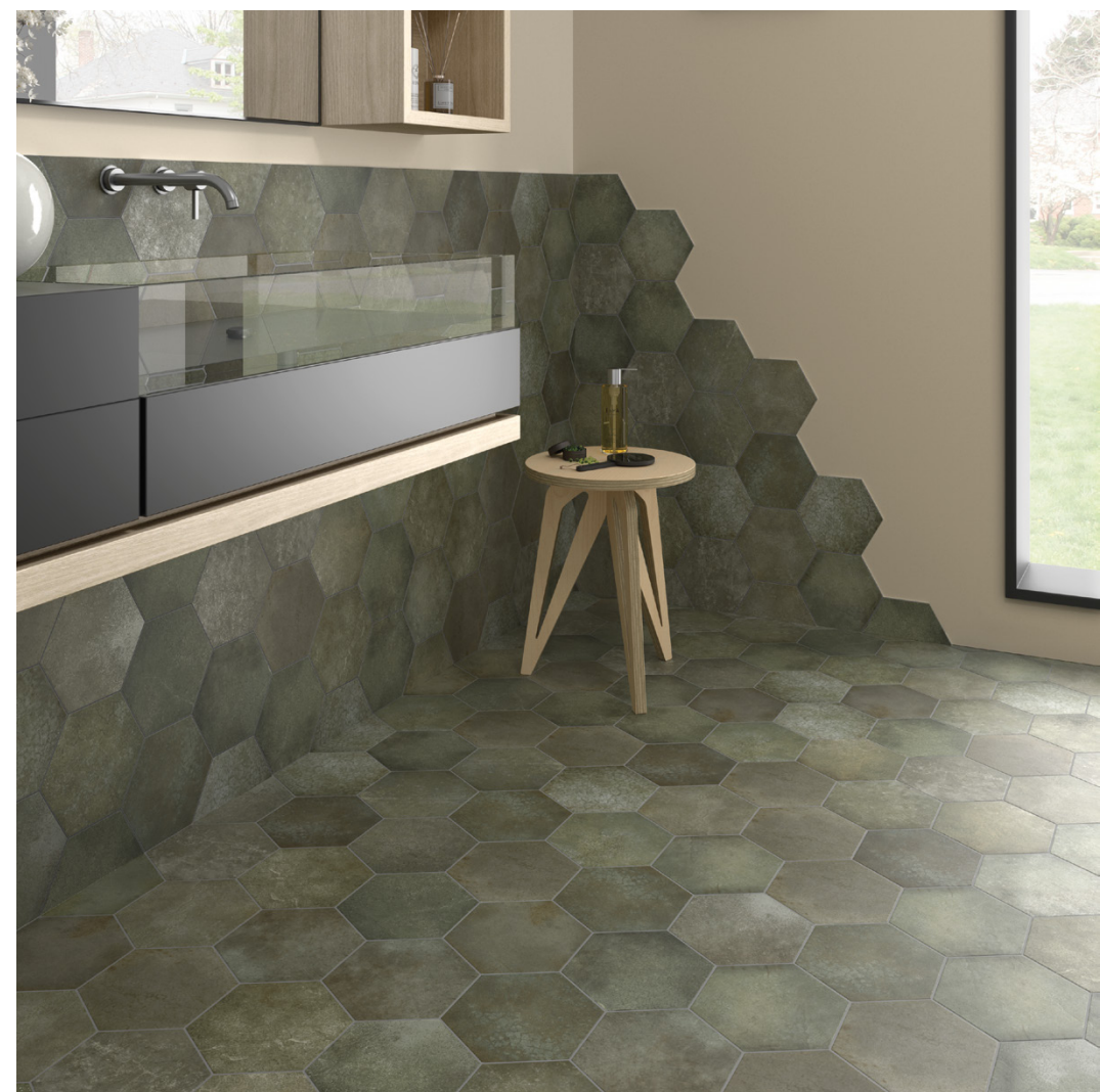
Heritage Jungle 17,5 x 20 cm / 7" x 8"