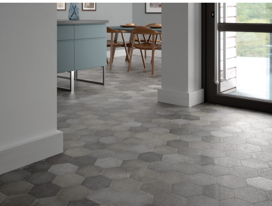
Heritage Shadow 17,5 x 20 cm / 7" x 8"